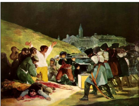
Francisco de Goya, The Third of May 1808